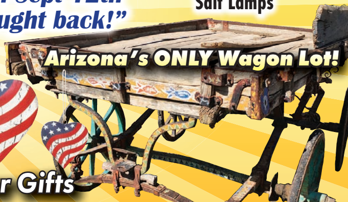
Arizona's ONLY Wagon Lot!